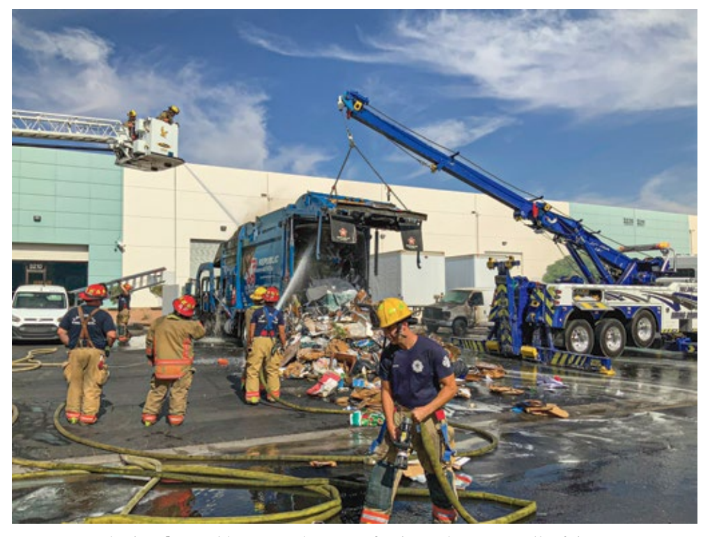
Batteries and other flammable materials pose a fire hazard — especially if they are improperly disposed of with household trash or recycling. Fires like this put the collection driver and surrounding vehicles in danger, damage expensive equipment, and risk starting larger fires.